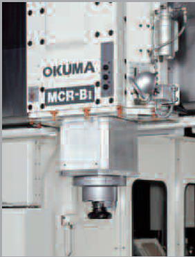
Up to 6 Attachments Available On The MCR-BIII