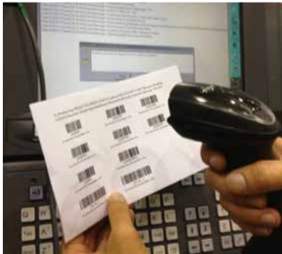
SIMPLE PROGRAM SELECTION VIA BARCODE APP

THE OSP-P300 ALLOWS USERS TO STREAMLINE CONTROL OPERATIONS AND CREATE THEIR OWN INNOVATIONS