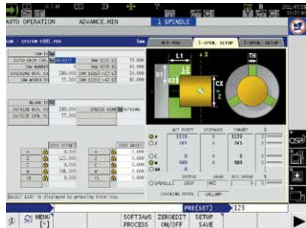
ZERO OFFSETS (OSP-P300S MULTUS)