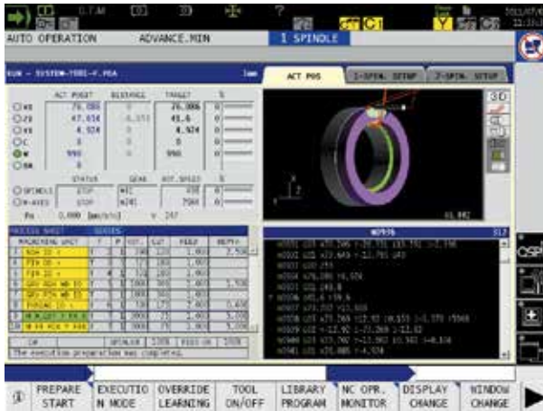
OSP-P300S (MULTUS) SCREEN EXAMPLES