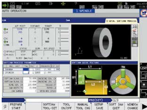
FORMING SOFT JAWS (OSP-P300S MULTUS)

A simple function key operation is all it takes to shift a zero offset to either the left or right end of a workpiece. The required zero offset is calculated automatically based on jaw and workpiece lengths (when the tool offset is set with reference to the turret tool mounting surface).