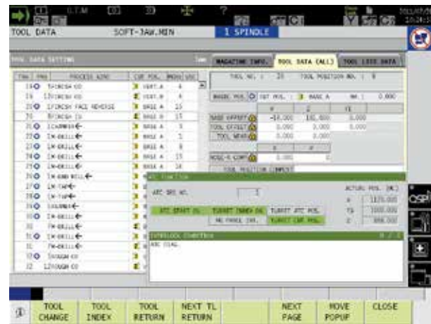
TOOL MOUNT/TOOL CHANGE